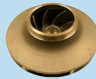
Bronze impeller on request

High-flow self-priming pool pumps at 4 poles up to 10 HP ideal for quiet operation and larger filtration. Cataphoresis painting, screws in AISI316 and pump body in polypropylene with glass fiber give a remarkable resistance to corrosion. In addition, a large support base make the whole system particularly robust.